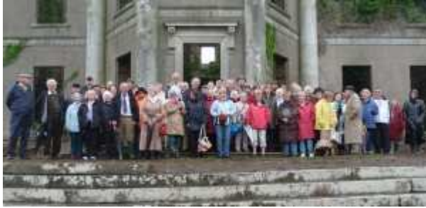
Society members on trip to Castleboro, June 2011

We followed this with an afternoon trip to Enniscorthy Castle and Castleboro on June 12 th .